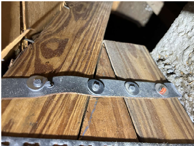
Roof to wall attachment - Clips