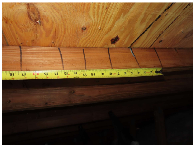
Roof deck nail spacing - Field