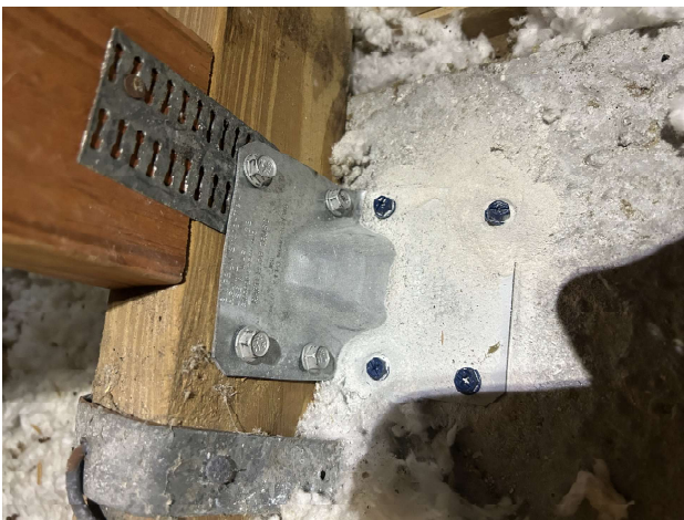
Roof to wall attachment - Clips