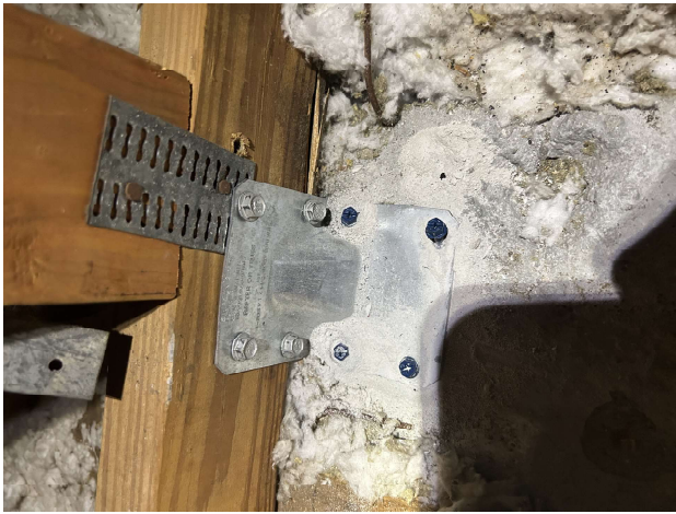
Roof to wall attachment - Clips