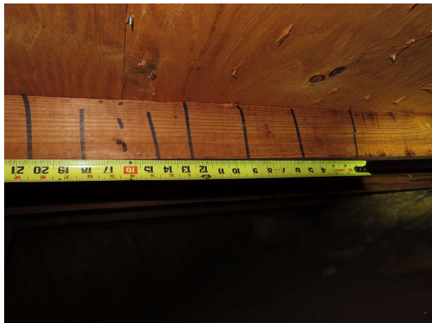
Roof deck nail spacing - Edge