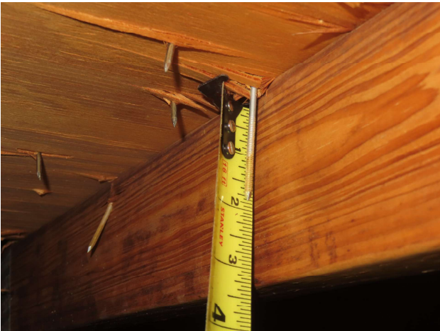
Roof deck attachment - 8d nails